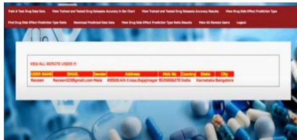
Figure5: User Details Dashboard