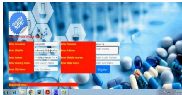
Figure4: User Registration Page