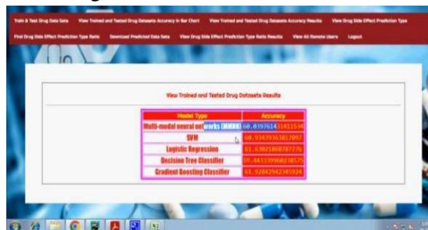
Figure6: Model Accuracy Results