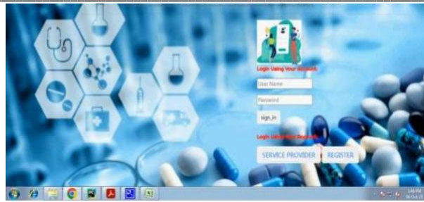
Figure3: User Login Page