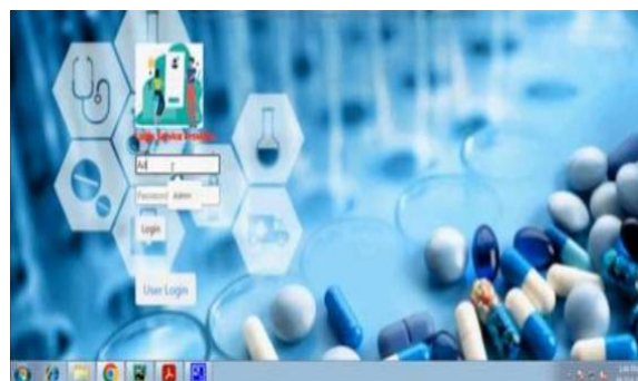
Figure2: Pharma Login Interface