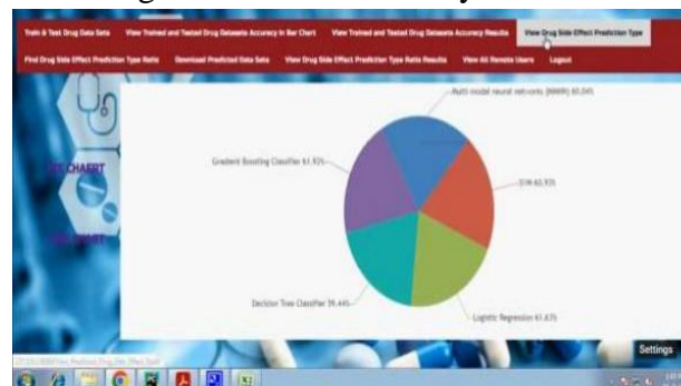
Figure7: Model Accuracy Pie Chart